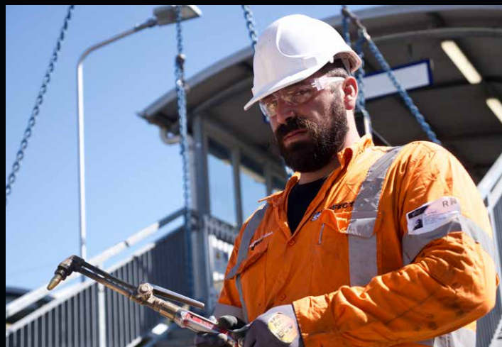
SKILLED RIW LABOURERS