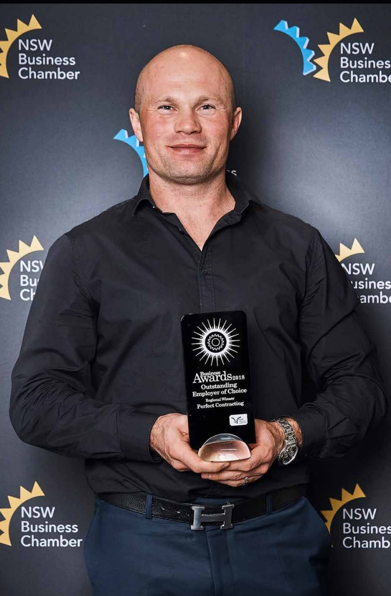
Winners of Outstanding Employer of Choice

“WE STRIVE TO PROVIDE A TRULY INCLUSIVE WORKPLACE WHERE EVERYONE IS VALUED AND TREATED WITH RESPECT, WITHOUT DISCRIMINATION OR BIAS.”